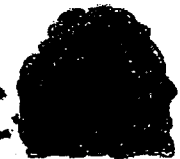
Mdm Salimah, volunteer